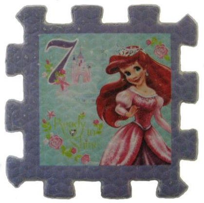
Figure 4 . Classroom toy

Classroom resources. Classroom resources can also sponsor spontaneous remarks about gender identity. Below we share a conversation a student initiated in relation to fairy-princess puzzle pieces in the classroom. Two girls approached Mr. Wacker proudly with a green bin that contained puzzle pieces put together in the form of a cake. They removed one piece from the puzzle cake and handed it to him.