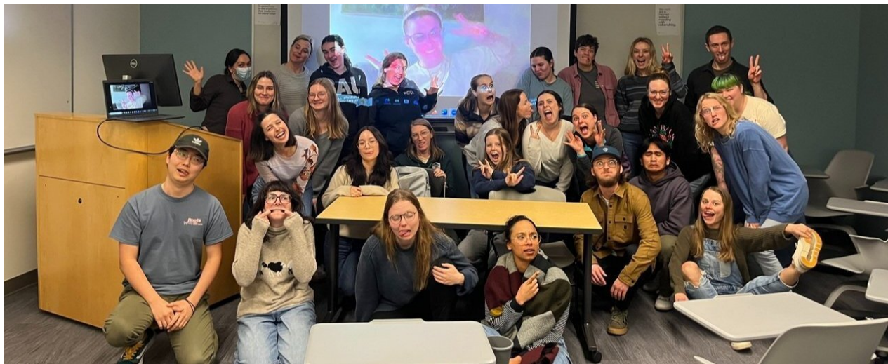
OT 647/747 OT Process with Adults II