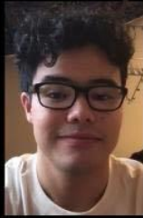
Senator-at-Large Sivan Najita