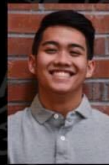
Junior Senator Aldrin Villahermosa