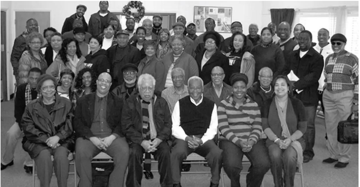
Members from The Black Collective

The Black Collective is a community of black people dedicated to civic engagement through volunteer service. Arising out of Tacoma, Washington's civil rights struggle in the 1960s, the Black Collective is a volunteer leadership organization engaged in addressing issues affecting the black community of Tacoma and Pierce County. They had a robust Black History Month Program that focused on Economic Development, Political Strategy, Social Justice, and Education. More information can be found here . The BAU looks forward to a partnership with The Black Collective in the near future.