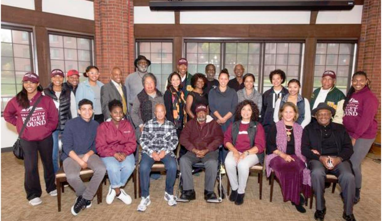
BAU during Homecoming and Family Weekend 2017