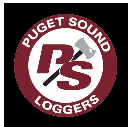
Maroon, gray, white, and black seal on black