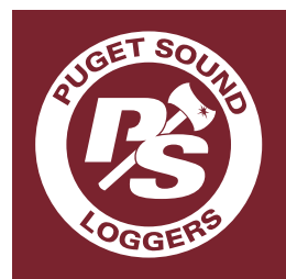
White seal on maroon