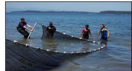
Narrows Bridge, 2009