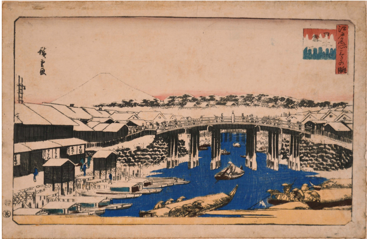
Clear Weather after Snow at Nihonbashi Bridge (Nihonbashi yukibare), from the series Three Views of Famous Places in Edo (Edo meisho mittsu no nagame)