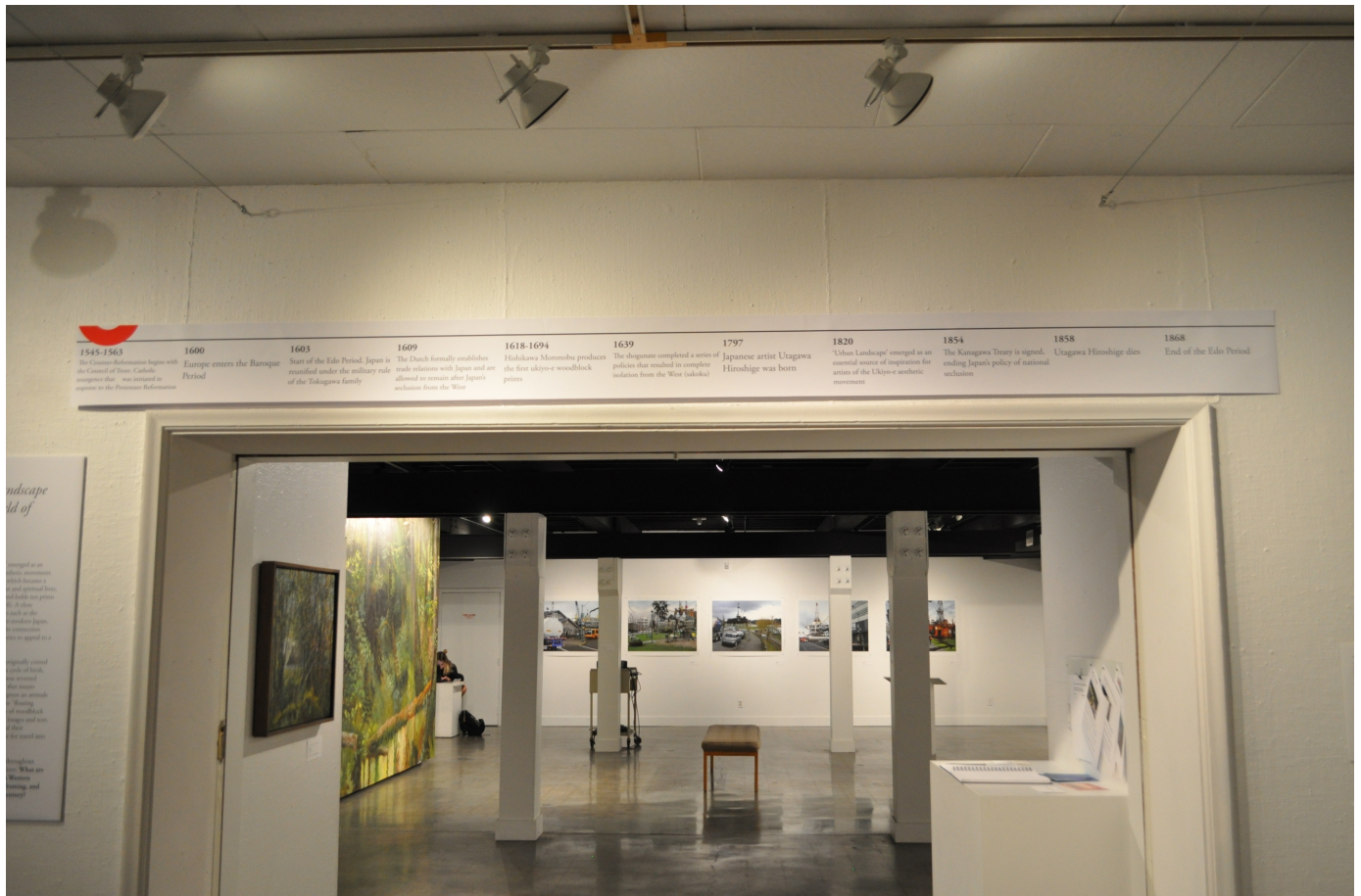
Photo of timeline, leading to neighboring exhibit.