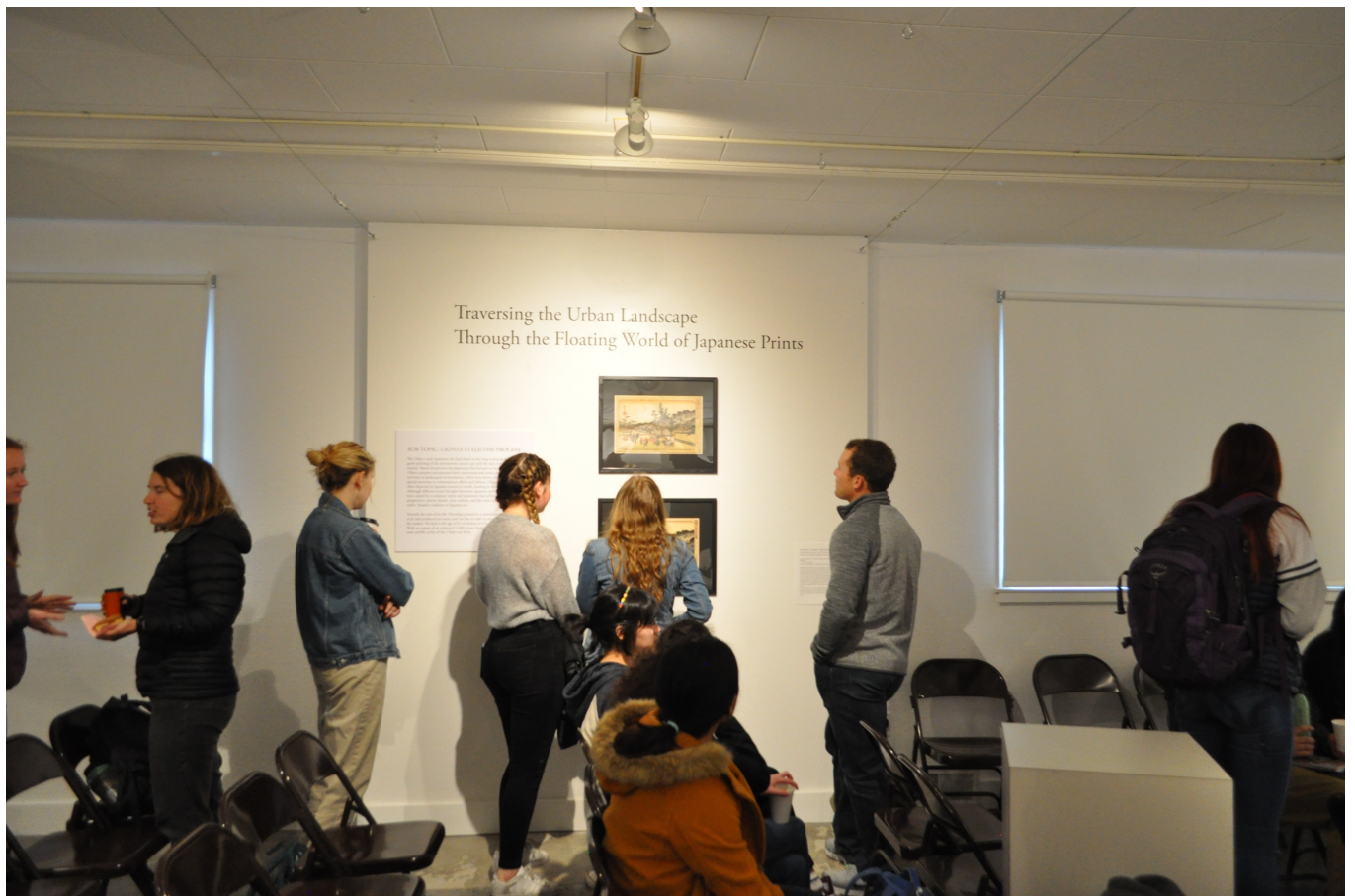
Photo from Curators' Talk & Reception on April 10, 2019