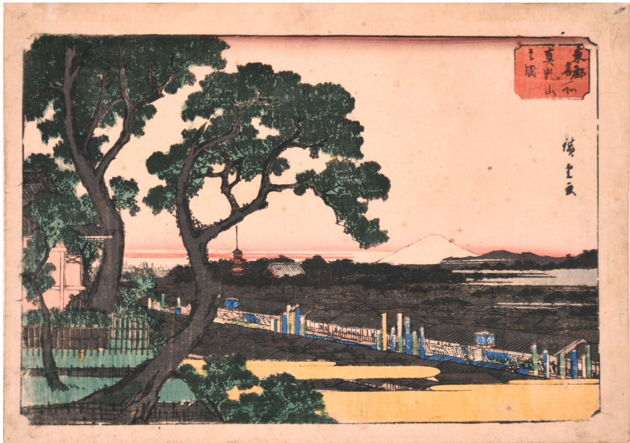
View of Matsuchiyama (Matsuchiyama no zu)