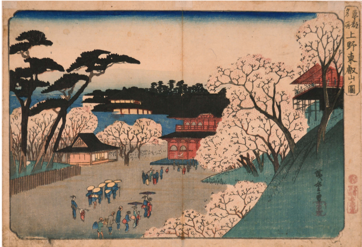
View of Toeizan Temple at Ueno (Ueno Toeizan no zu), from the series Famous Places in the Eastern Capital (Toto meisho)