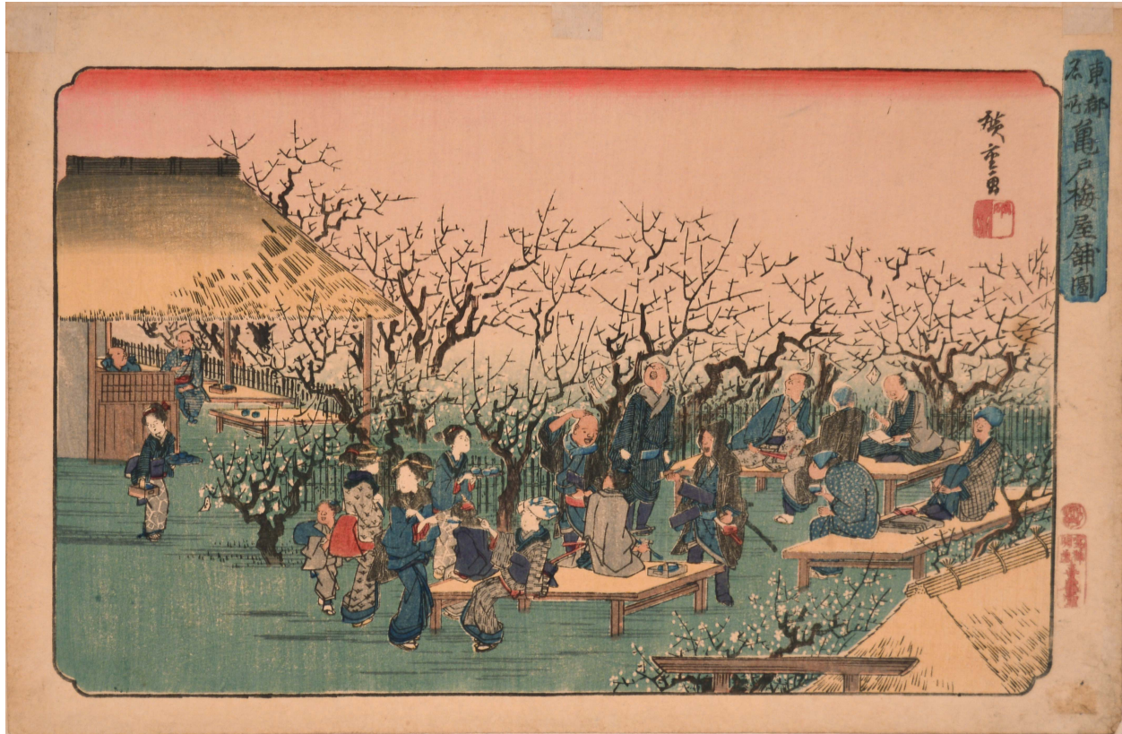
Plum Garden at Kameido (Kameido ume yashiki no zu), from the series Famous Places in the Eastern Capital (Toto meisho)

Utawarai Hiroshige I (1797–1858), Publisher Sanoya Kihei (Kikakudo)