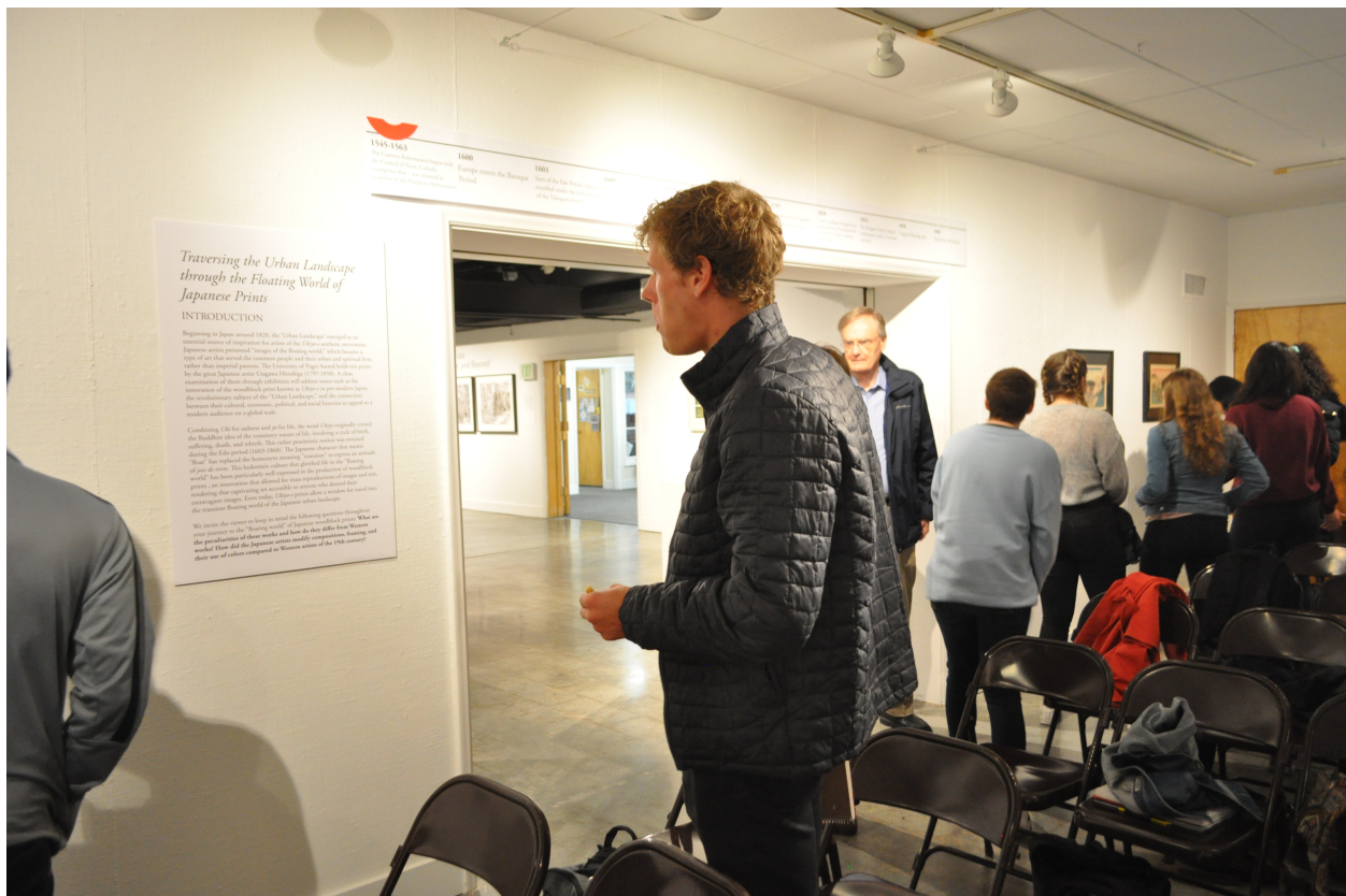
Students engaging with the wall text and Hiroshige Prints at the curators’ talk on April 10, 2019.

The exhibit will be up until April 20 and can be viewed during Kittredge’s daily hours, 10 a.m. to 5 p.m. Monday through Friday and 12 to 5 p.m. Saturday.