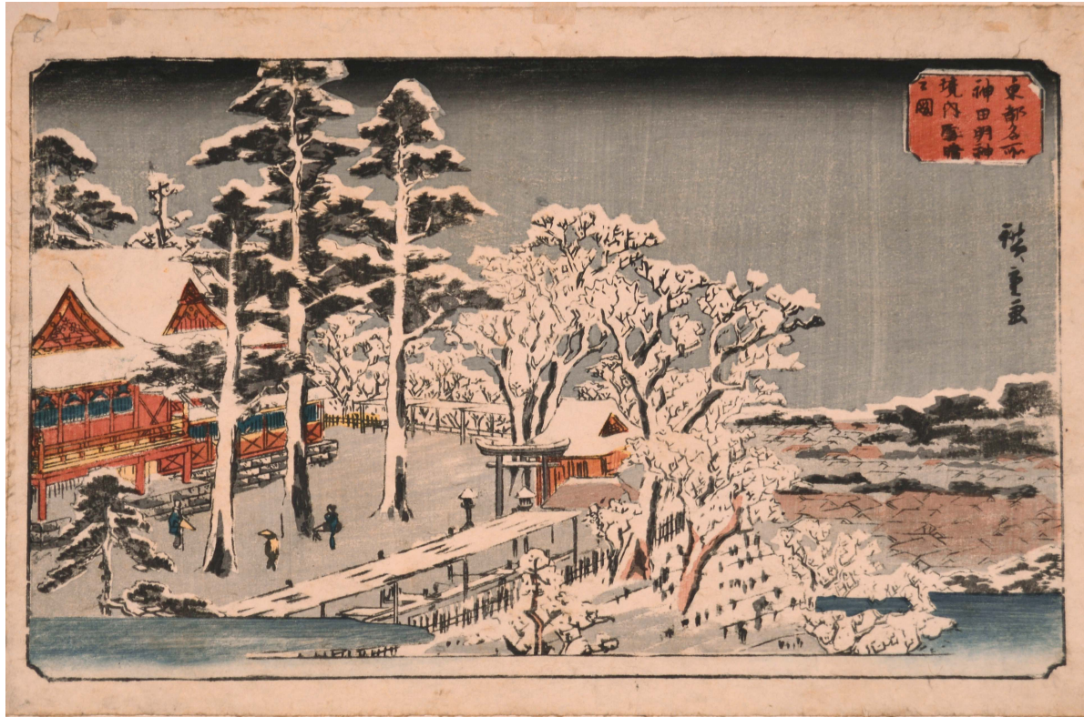
Clear Weather after Snow in the Precincts of the Kanda Myojin Shrine (Kanda Myojin keidai yukibare no zu), from the series Famous Places in the Eastern Capital (Toto meisho)

Utagawa Hiroshige I (1797–1858), Publisher Nunokichi ca. 1840–1842, Edo Period Polychromatic Woodblock print ( nishiki-e ); ink and color on paper