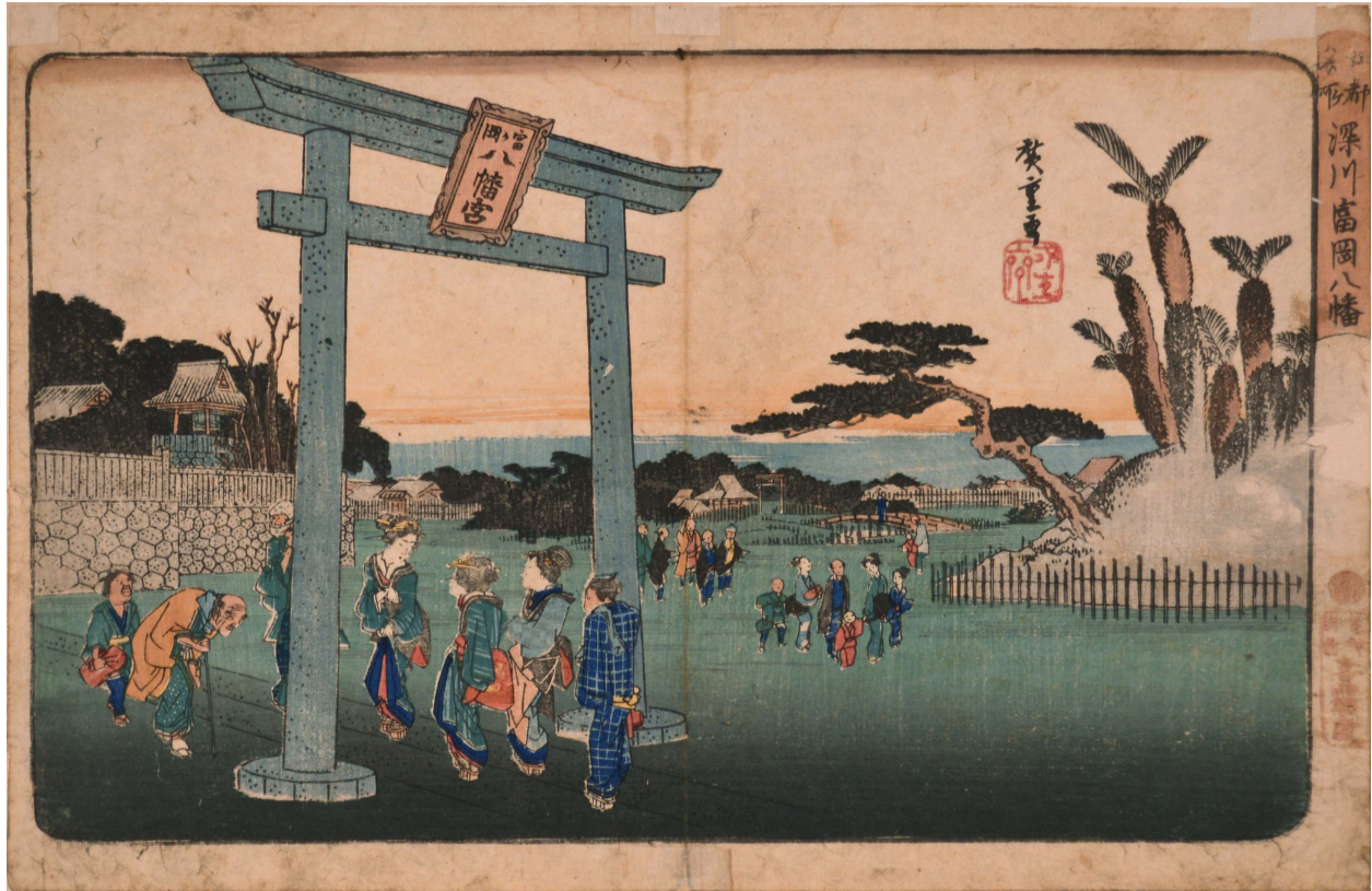
Tomioka Hachiman Shrine, Fukagawa (Tomioka Hachimangu, Fukagawa )