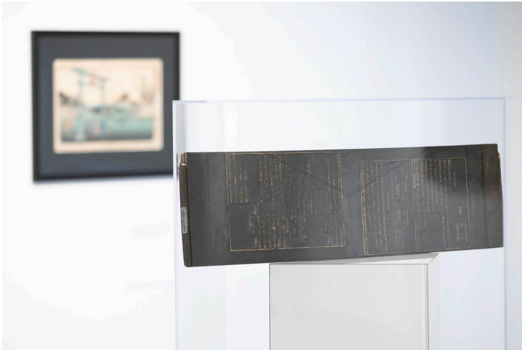
Object on Display: Japanese Woodblock Plate of Four Pages From Chiba Ichiryu's Book of Flower Arrangement (Nageire Hanasusuki) , 1767, Vol 2. Private Collection