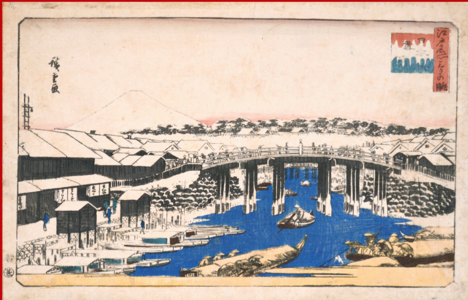
Clear Weather after Snow at Nihonbashi Bridge, ca. 1839-42, Edo Period, Polychromatic woodblock print; ink and color on paper, 24.2 x 36.7 cm, University of Puget Sound Collection

Kittredge Gallery University of Puget Sound Presents