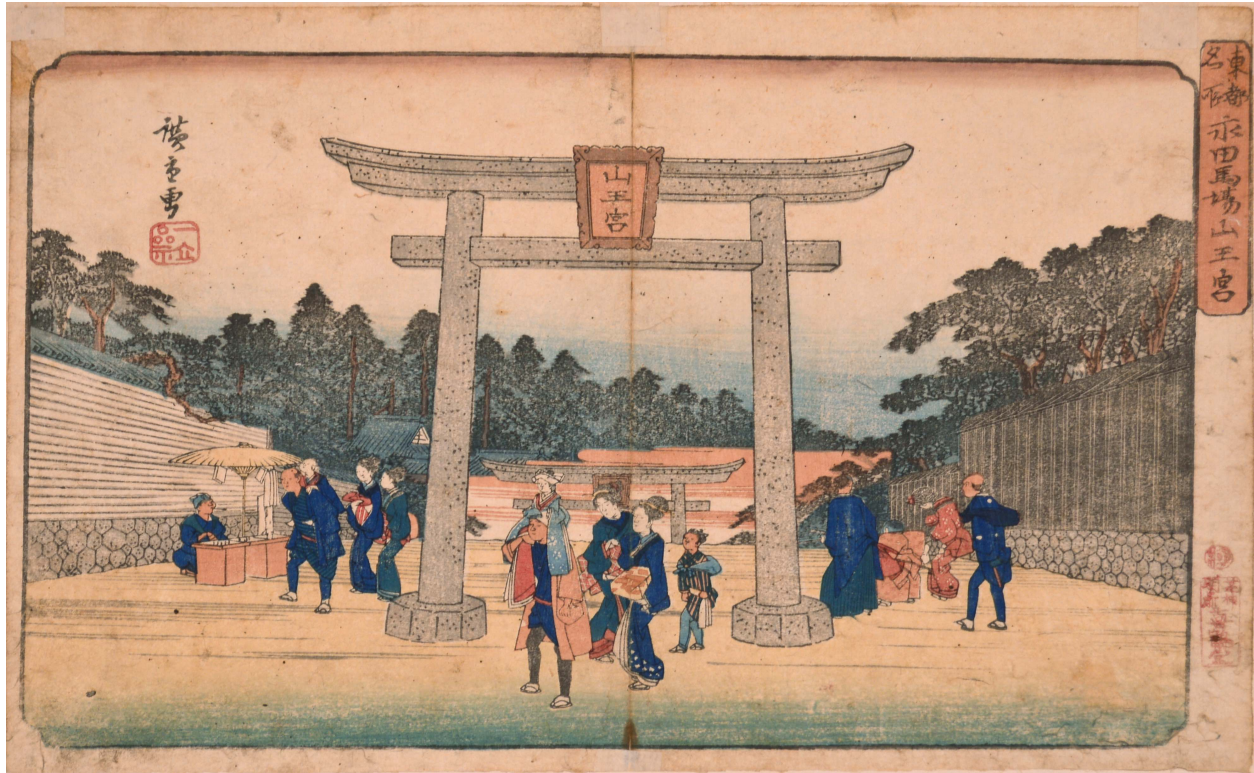
Sannô Shrine at the Nagata Riding Grounds (Nagatababa Sannôgû), from the series Famous Places in the Eastern Capital (Tôto meisho)