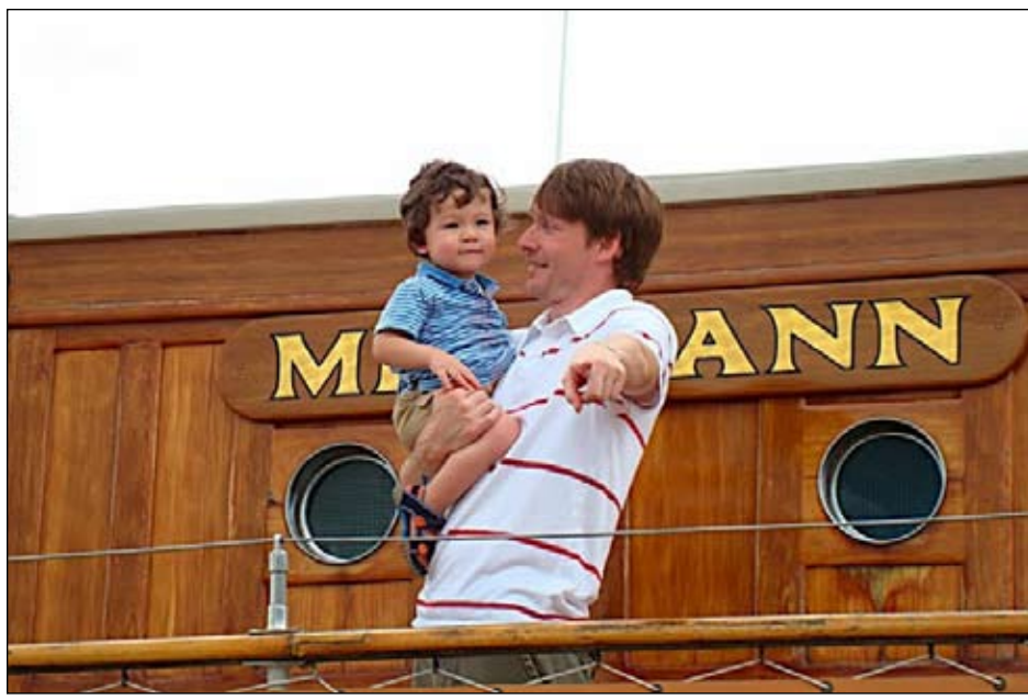
Taking a few stops closer to your subject often makes for a much better photo.